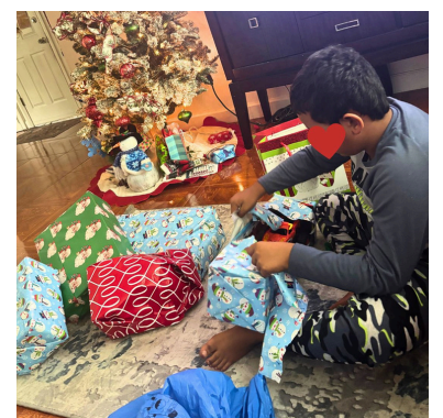
Photos from: TLC's Holiday Party, What's Your Rudolph Story submissions, Rudolph Warehouse, HFC Holiday Door Decorating Contest, HFC's Angel Shoebox Christmas Project and HFC's Holiday Party.